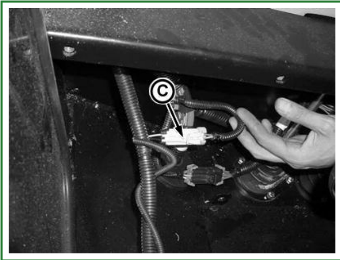
P13222-UN: Cover and cap screws