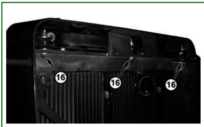
TX1018434A-UN: Grille Housing Cap Screws and Rubber Mounts