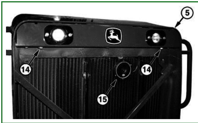
TX1018433A-UN: Light Panel and Horn