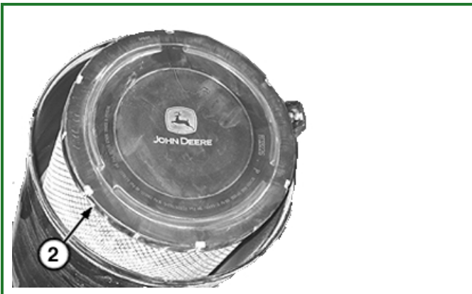
TX1090640-UN: Primary Element