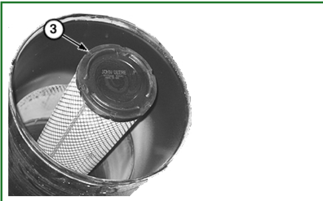
TX1090641-UN: Secondary Element