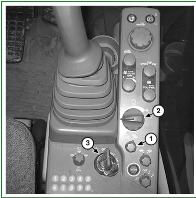
TX1087012A-UN: Switch Panel