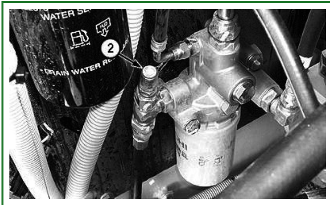
TX1000761A-UN: Hydraulic Sample Port