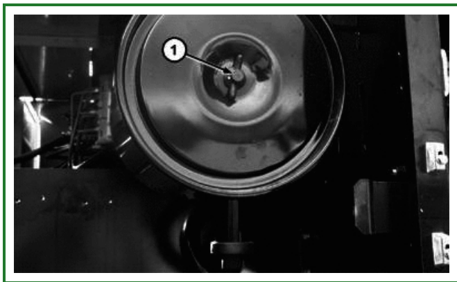
T147443C-UN: Air Cleaner Element