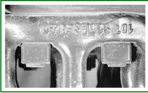
T82862-UN: Track Shoe Torque