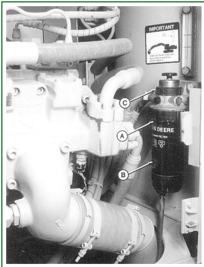
T102466-UN: Replace Primary Fuel Filter (Water Separator)