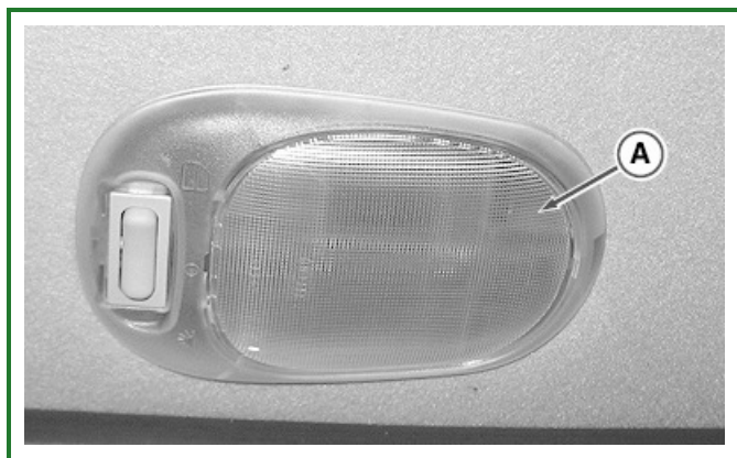
RXA0099130-UN: Remove Cover