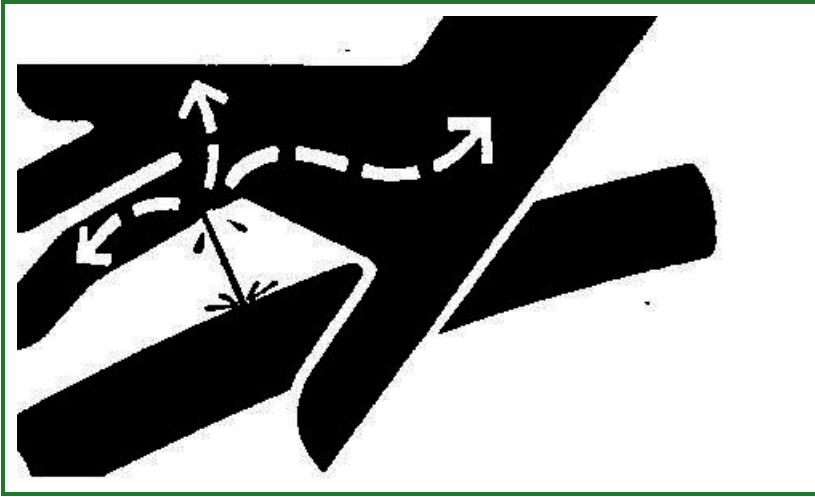
X9811-UN: Refrigerant Penetrating Skin